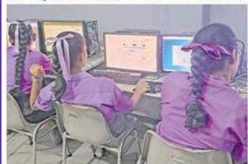
Students at Leeds International School are amongst the first in Sri Lanka to utilise IGCSE Buddy in their exam preparation

This includes in-person/online exam seminars, weekly global quizzes with exciting prizes, real-time analytical dashboards for schools, spotlight on the school's commitment to IGCSE excellence, and awards and certifications for teachers and students. For more information, schools may visit www.igcsebuddy.com .